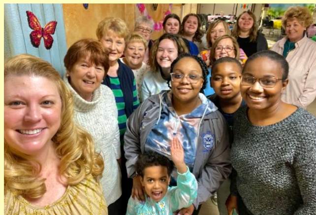
The best Children’s Easter Celebration helps a ministry could ask for!