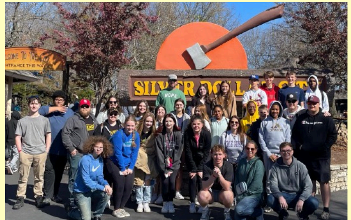
Pictured above are the St. Matthew youth, leaders and sponsors at young Christians weekend at Silver Dollar City!

May 30 - First Tuesday lunch of the summer! We'll meet at the church at 11:30, bring your own lunch, and we'll have a quick Devo/Bible study time. Then hang out!