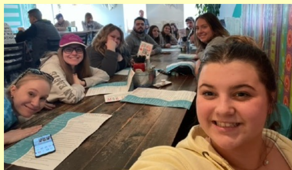
College Ministry spring retreat to Little Grassy

We will be starting a new study: Jesus in our Generation at our normal meeting time, Wednesdays starting at 6 pm. If you are 18 to 25 we would love for you to join us for food, fellowship, and diving deeper into the word.