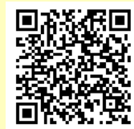
QR for VBS

“ STELLAR ” Vacation Bible School is June 12 – 16 from 9:00 am – 12:00 pm for potty-trained preschool through finishing 6 th graders. Child & Volunteer Registration is now available at vbspro.events/p/stmatthewvbs2023 or at the V.B.S. Display in the main foyer. Join us on this epic adventure as we journey into outer space to truly learn how to Shine Jesus’ Light. It’s free! (V.B.S. Work Week is June 5 – 7 from 1:00 pm – 5:00 pm.)