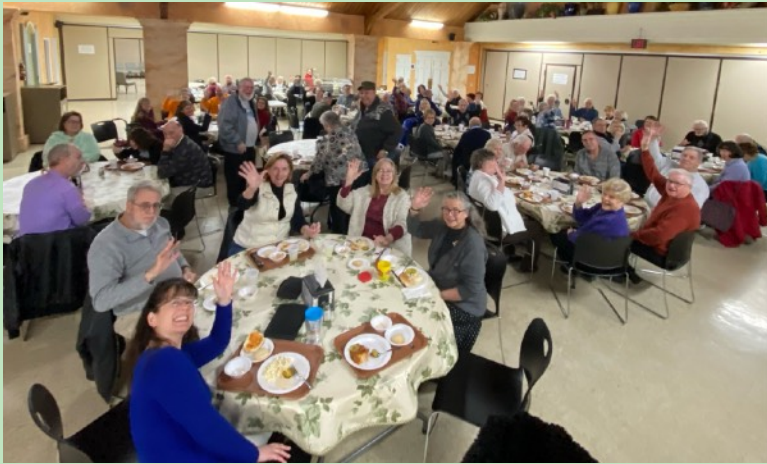
January's LifeGroups enjoying dinner together! Come join us next month.

We now have a LifeGroup opportunity for every age group in the church, so that people in their 20's to people in their 90's can have a large group with which to gather and grow in their faith together.