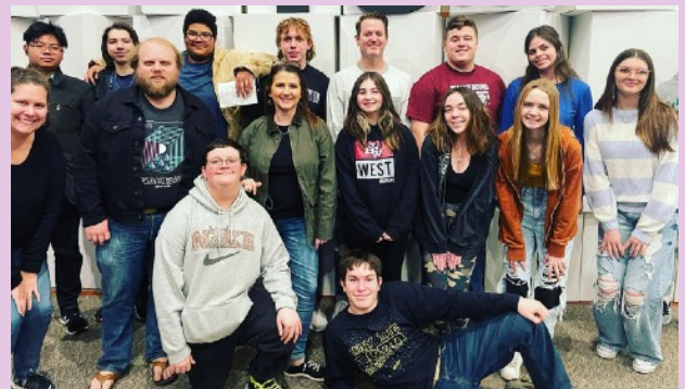
Our youth, leaders and sponsors at Fire-Up 2023!

March 31 - April 2 - Young Christians Weekend, Branson, MO.