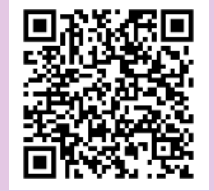
QR for VBS

Beulah Kids Camp registrations are now available at https://brushfire.com/beulahholinesscamp . Beulah Bible Camp is for kids finishing 4 th – 6 th grade and held on June 26 – 29. Beulah Beginning Camp is for kids finishing 1 st – 3 rd grade and held on June 30 – July 1. To stay in the church cabins and for a price break, please make sure you join the “St. Matthew Church” group (passcode: Lindsay). Packing info & more info coming closer to camp time!